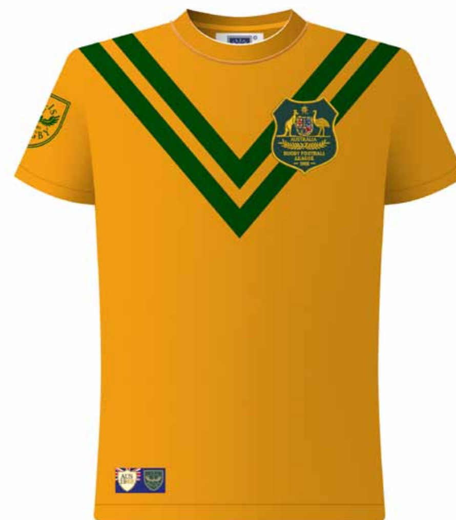
AUS RL 1968 T-Shirt Available in sizes S to 5XL