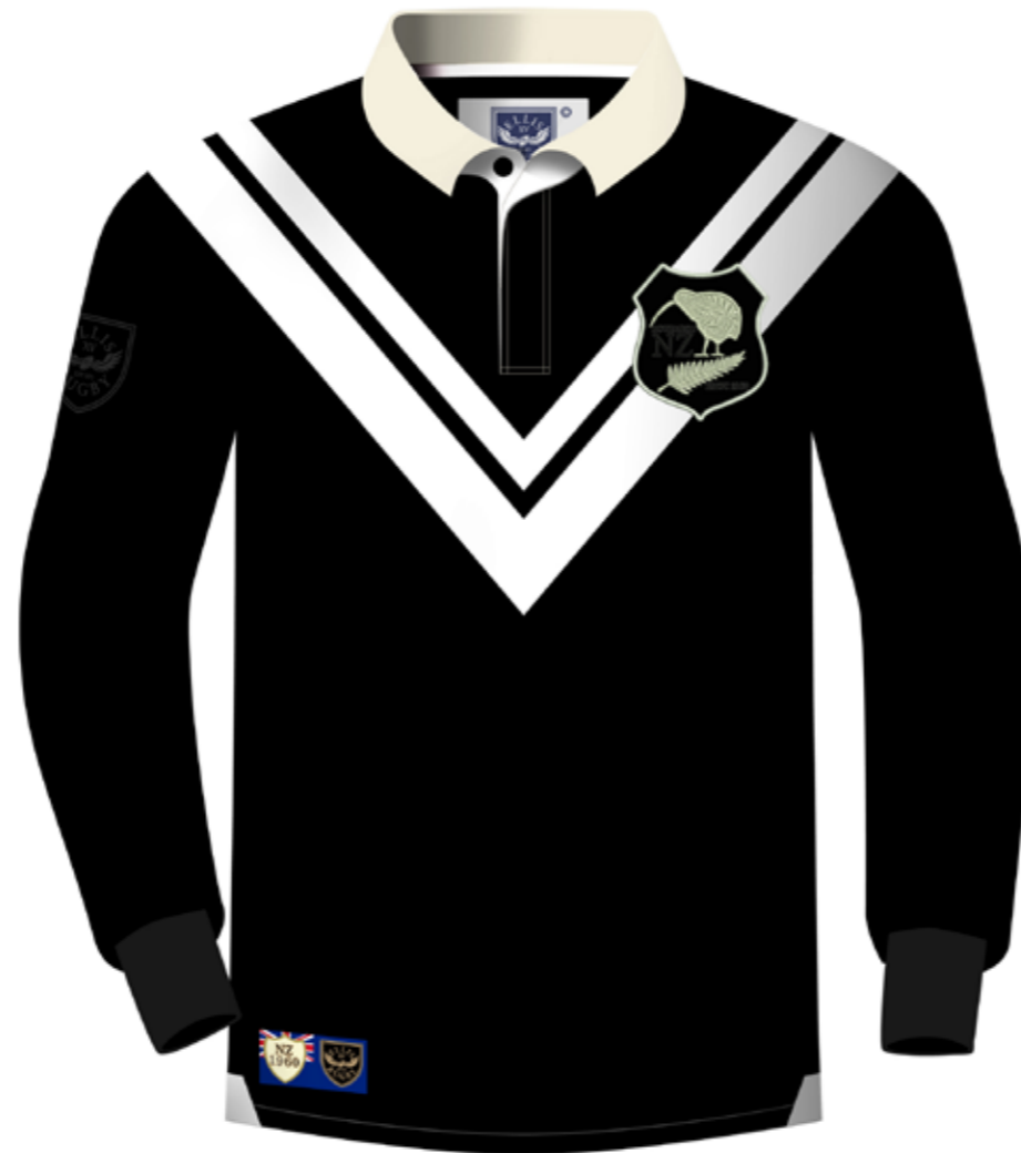
NZ RL 1960 Rugger Available in sizes S to 5XL