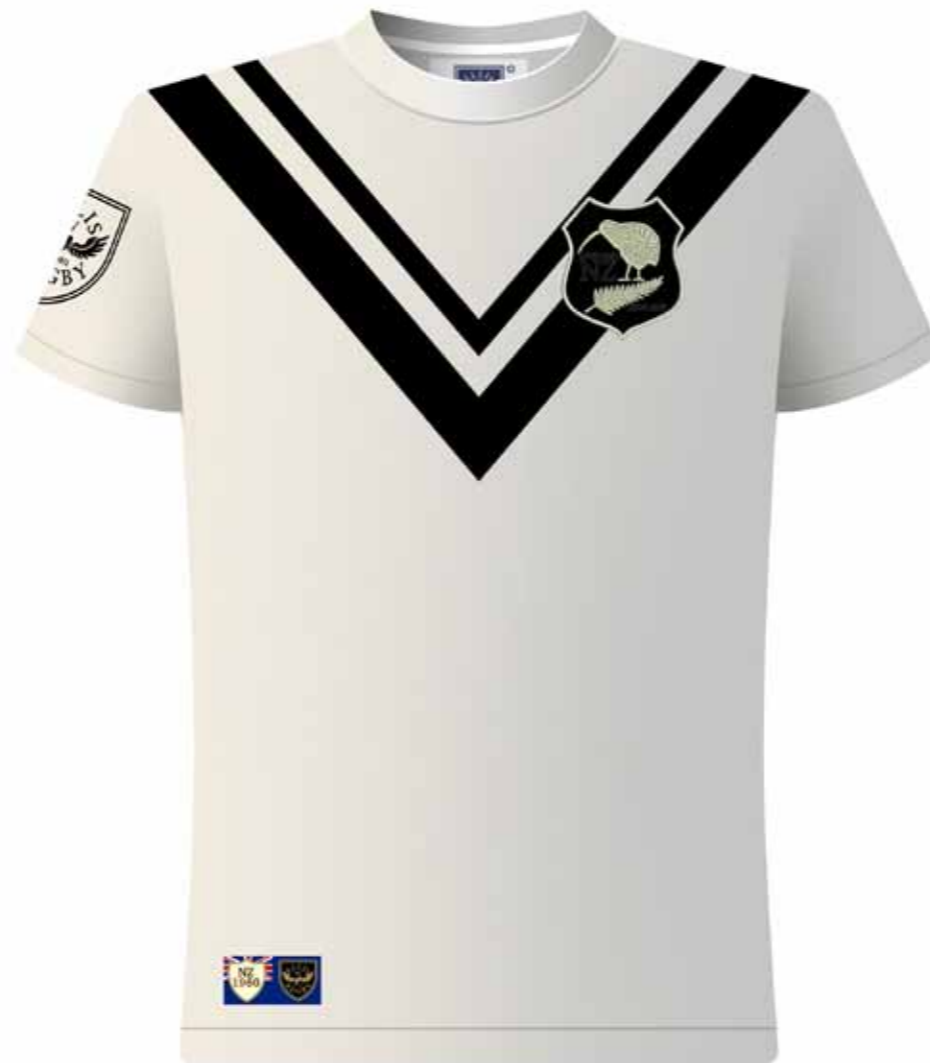
NZ RL 1960 T-Shirt Available in sizes S to 5XL