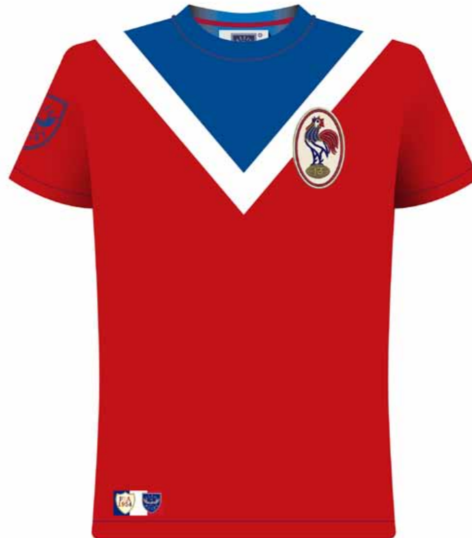
FRA RL 1954 T-Shirt Available in sizes S to 5XL