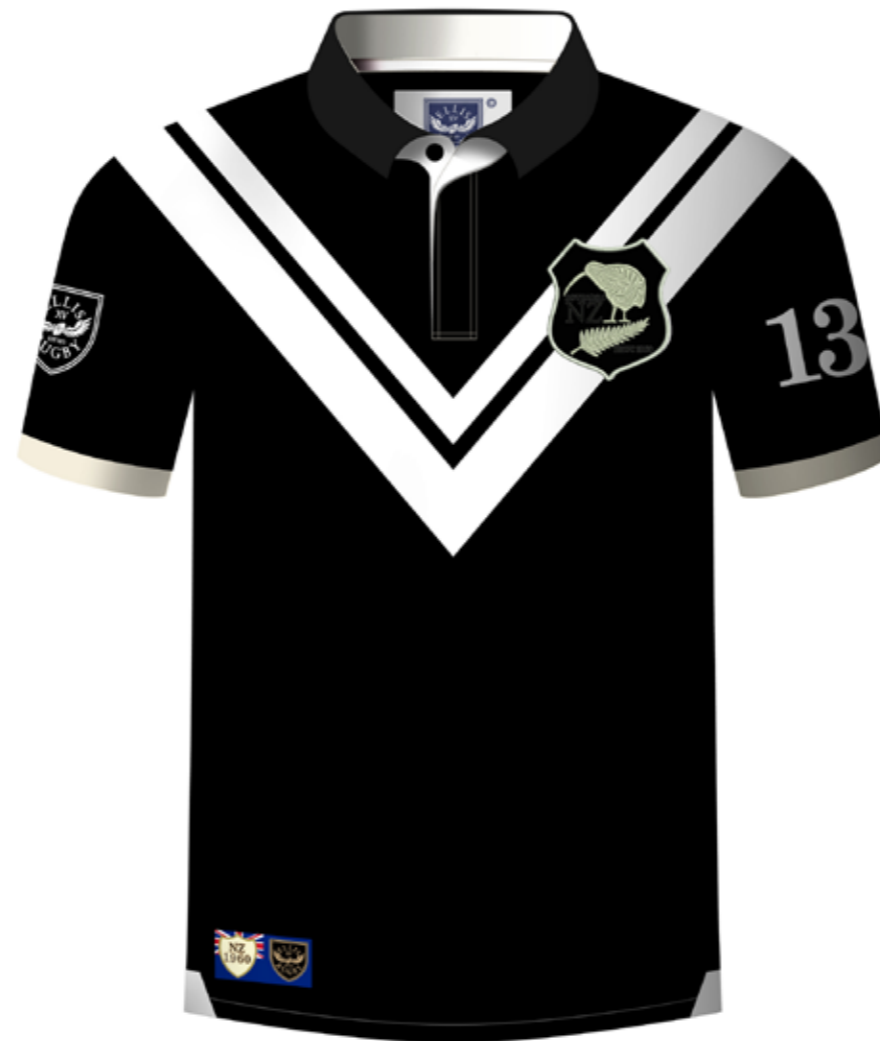
NZ RL 1960 Polo Available in sizes S to 5XL