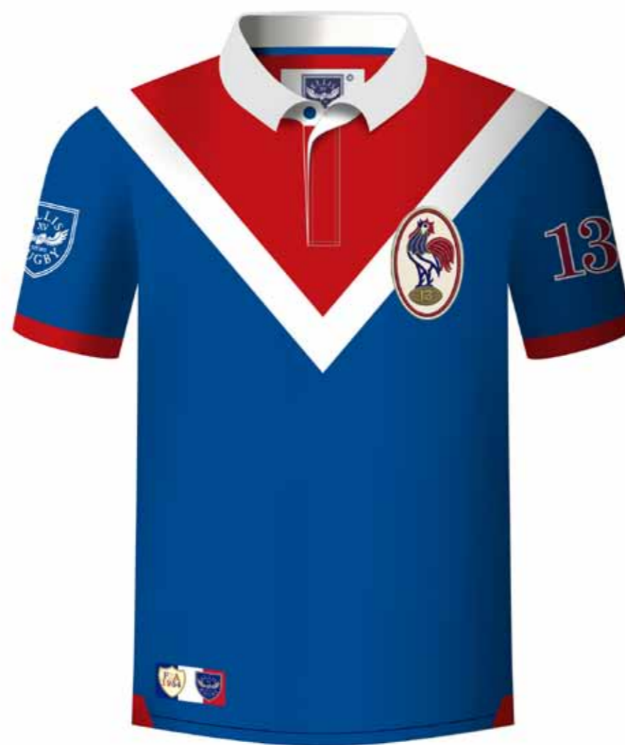
FRA RL 1954 Polo Available in sizes S to 5XL