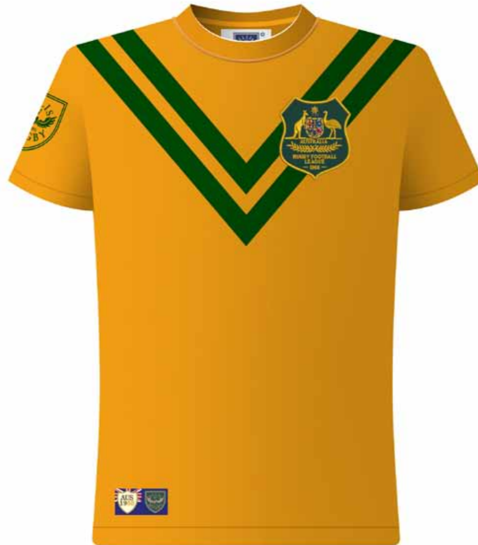
AUS RL 1968 T-Shirt