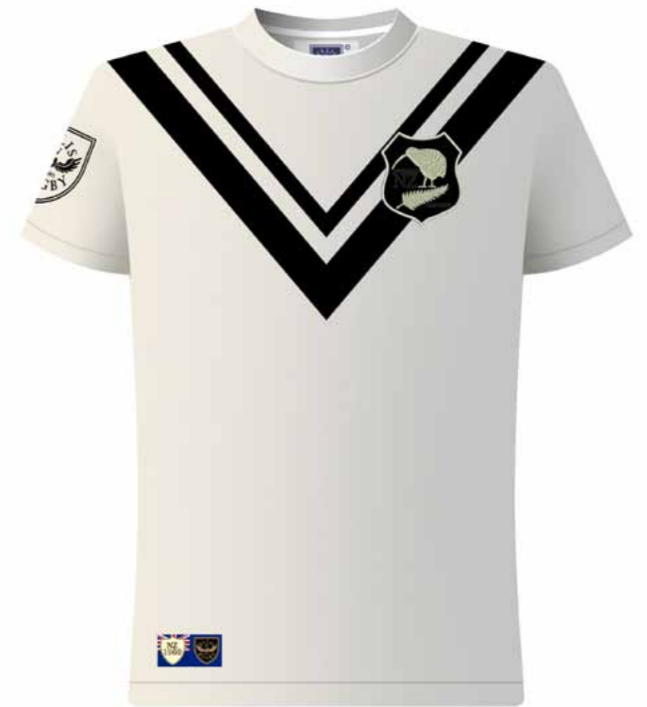
NZ RL 1960 T-Shirt Available in sizes S to 5XL