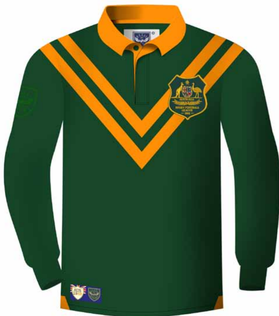
AUS RL 1968 Rugger Available in sizes S to 5XL