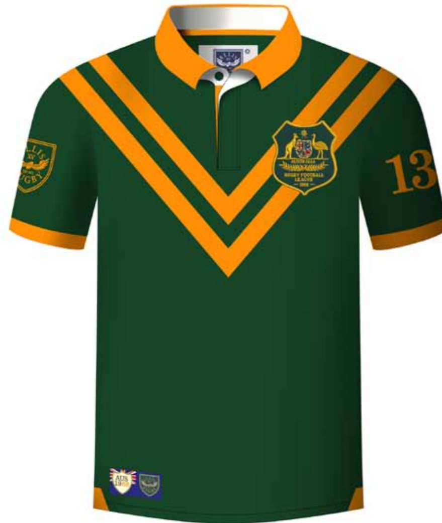
AUS RL 1968 Polo Available in sizes S to 5XL