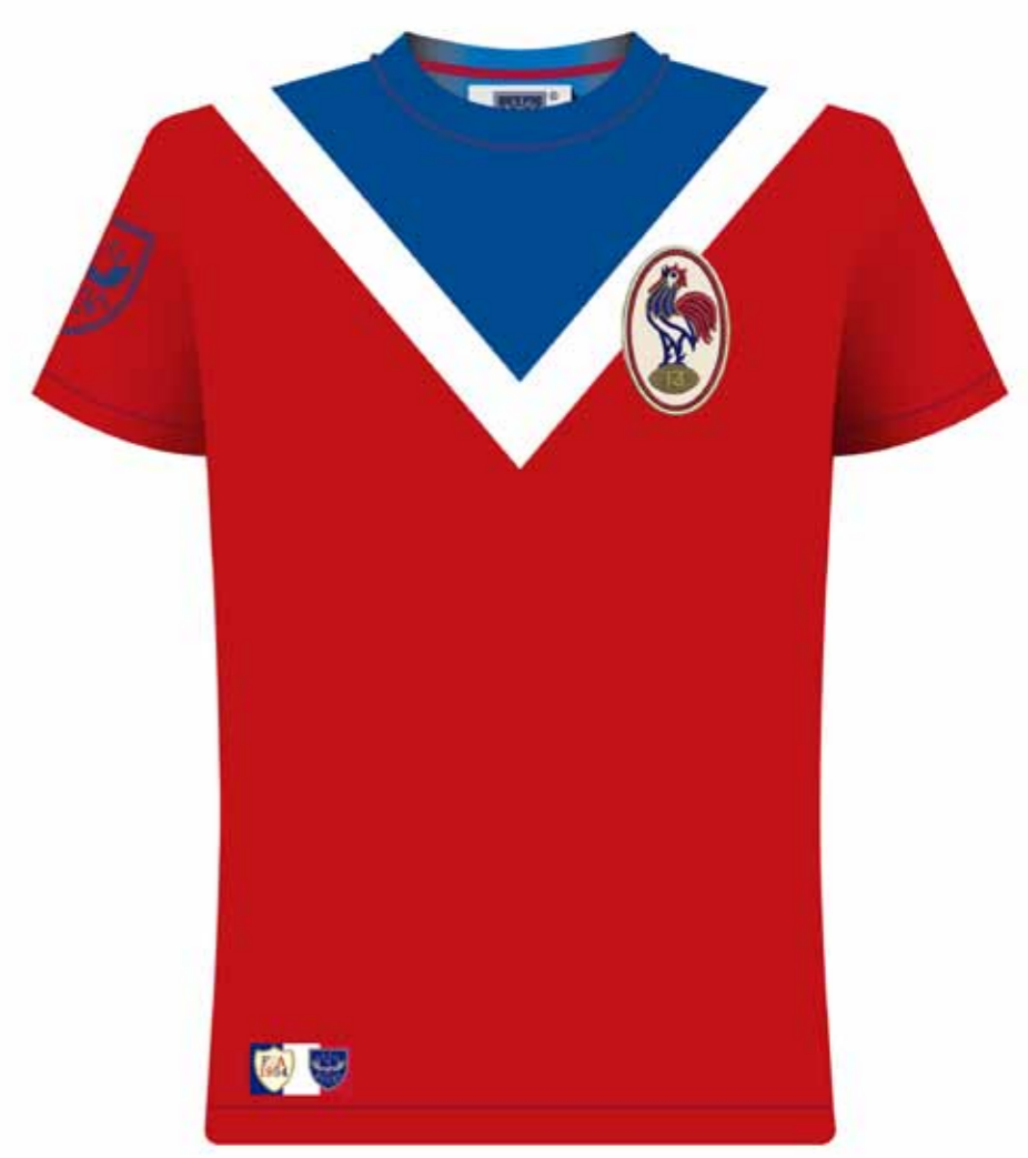
FRA RL 1954 T-Shirt Available in sizes S to 5XL