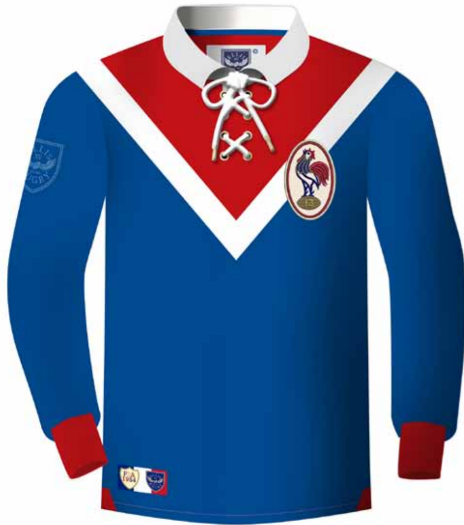
FRA RL 1954 Rigger Available in sizes S to 5XL